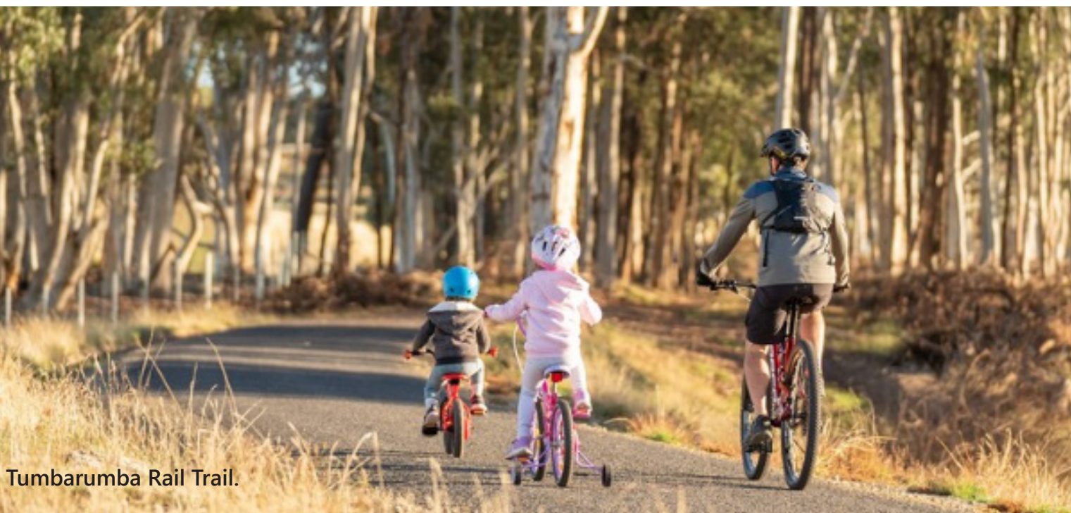
Tumbarumba Rail Trail.

* Monaro Rail Trail Feasibility Study 2019